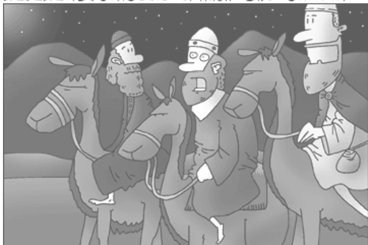
(See Luke 2:1-16)