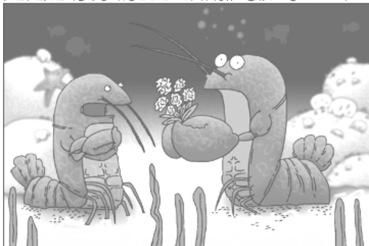
Thanks to Kevin Adelsberger (See 1+Corinthians 13:1-10B-26-2013)