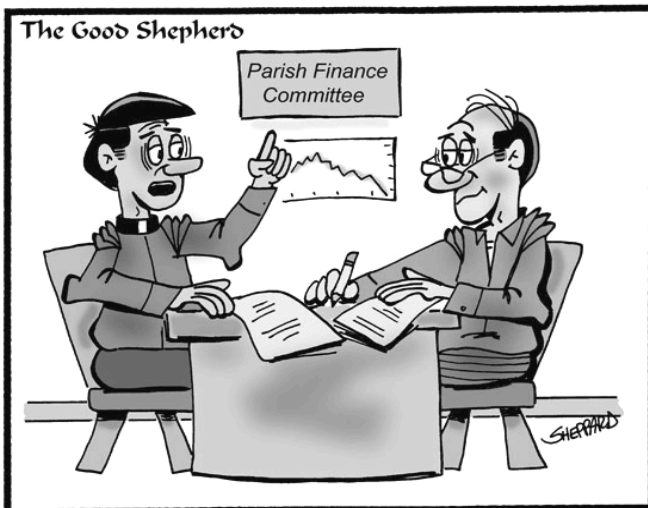
"We need to bailout the Building Fund."