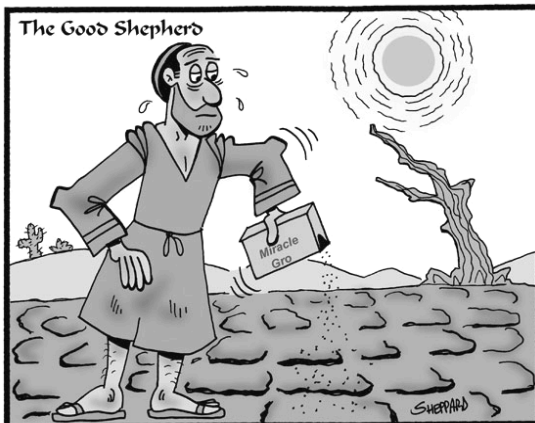
Faith Based Gardening

Universal: Sports: That sports may be an opportunity for friendly encounters between peoples and may contribute to peace in the world.