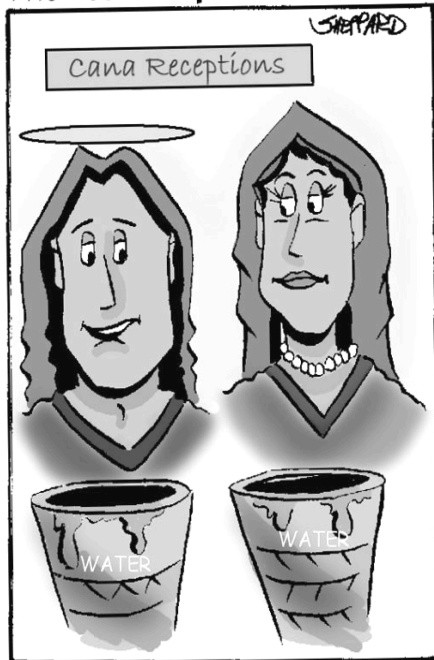
"I'd love to Mother but remember I am under 18."