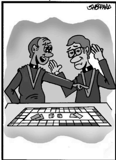
The Good Shepherd

"Go directly to purgatory. Do not pass go."