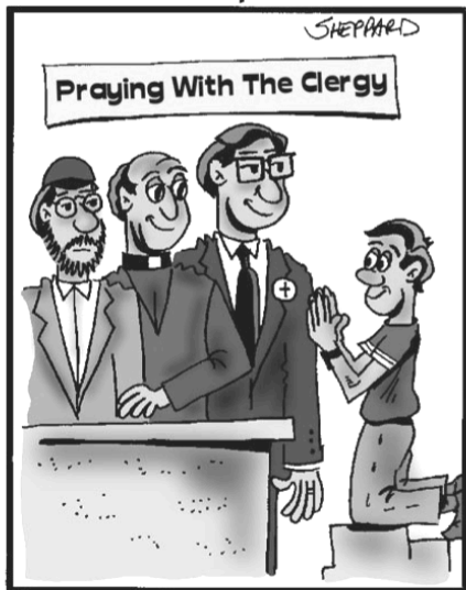
New Reality T.V. Game Show

First Holy Communions will begin next Saturday morning, at 10am on 30 th April for 4 weeks. Please keep these Children in your prayers. Would Parents/ Godparents also bring your child along to receive the Sacrament of Reconciliation/ Confession . Clearly you may attend any parish for this. No Saturday morning Reconciliation/ Confession here for the next 4 Saturdays. Apologies for any inconvenience.