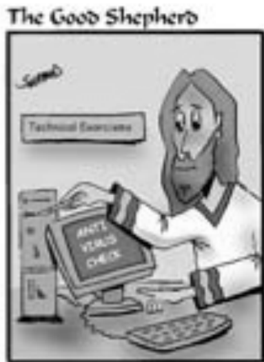
Chasing the Devil Out

Glasnevin Cemetery Interfaith Service at Remembrance Wall for all those who died at the Easter Rising . Prayer by Archbishop Diarmuid Martin today (3 rd April 2016)