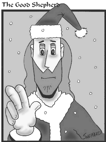
Peace on Earth and Merry Christmas

Crib Donations will fund St Margaret Children & Family Care Society . This helps couples to adopt, foster & support children. ?adoptive/ fostering parent, contact the Society at 274 Bath St, 0141- 332 8371 or try www.stmargaretsadoption.org.uk