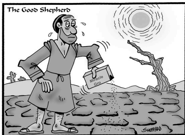
Faith Based Gardening