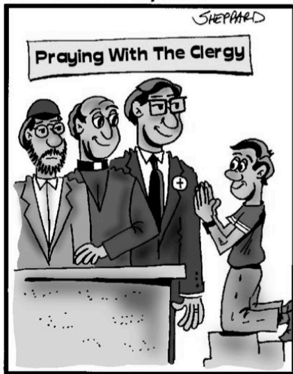
New Reality T.V. Game Show

Honouring the Commitment of 18+ year olds Interested in meeting for "this & that", perhaps the World Youth Day 2016 in Poland?