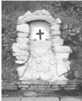
New Shrine at Nethercroy

Feast days Tuesday: St Martha ; Wednesday: St Peter Chrysologus ; Thursday: St Ignatius of Loyola ; Friday: St Alphonsus ; Saturday: St Eusabius of Vercelli