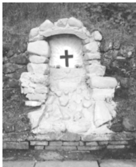
New Shrine at Nethercroy

Feast days Monday: St Lawrence of Brindisi ; Tuesday: St Mary Magdalene ; Wednesday: St Bridget (of Sweden) ; Thursday: St Sharbel Makhlef and St Declan ; Friday: St James ; Saturday: Sts Joachim & Anne ;