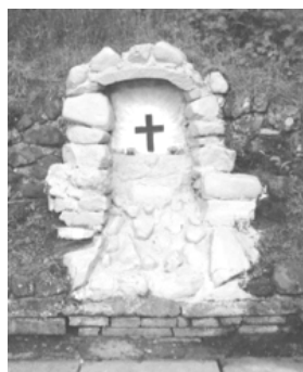
New Shrine at Nethercroy

Feast days Monday: St Camillus de Lellis ; Tuesday: St Bonaventure ; Wednesday: Our Lady of Mount Carmel