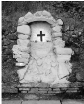
New Shrine at Nethercroy (see inside)